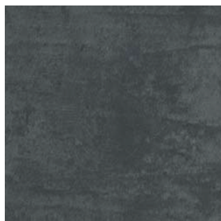
Dark Cement (Smooth)