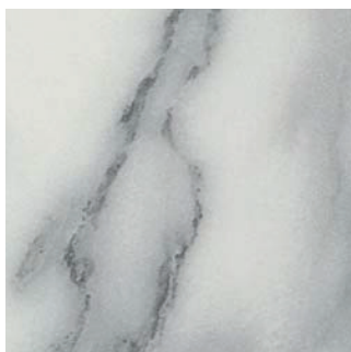
Calacutta Grey (Smooth)