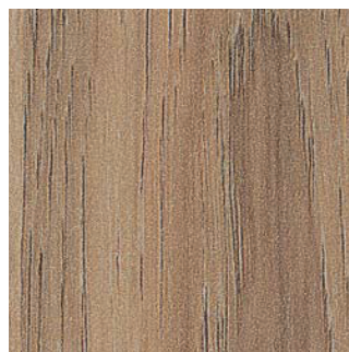
Prime Oak (Woodmatt)