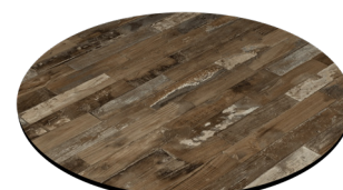
RUSTIC BLOCK WOOD