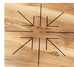
Routed grooves to be used as predrilling holes